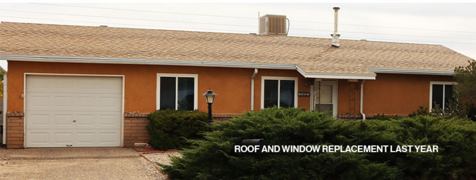
ROOF AND WINDOW REPLACEMENT LAST YEAR

One final note – while eligibility is based on income and household size, veteran disability benefits are NOT used in qualifying income.