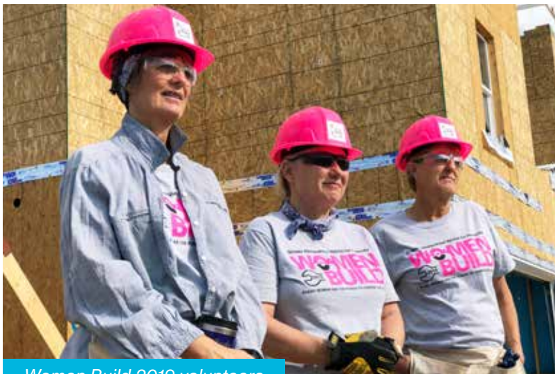
Women Build 2019 volunteers