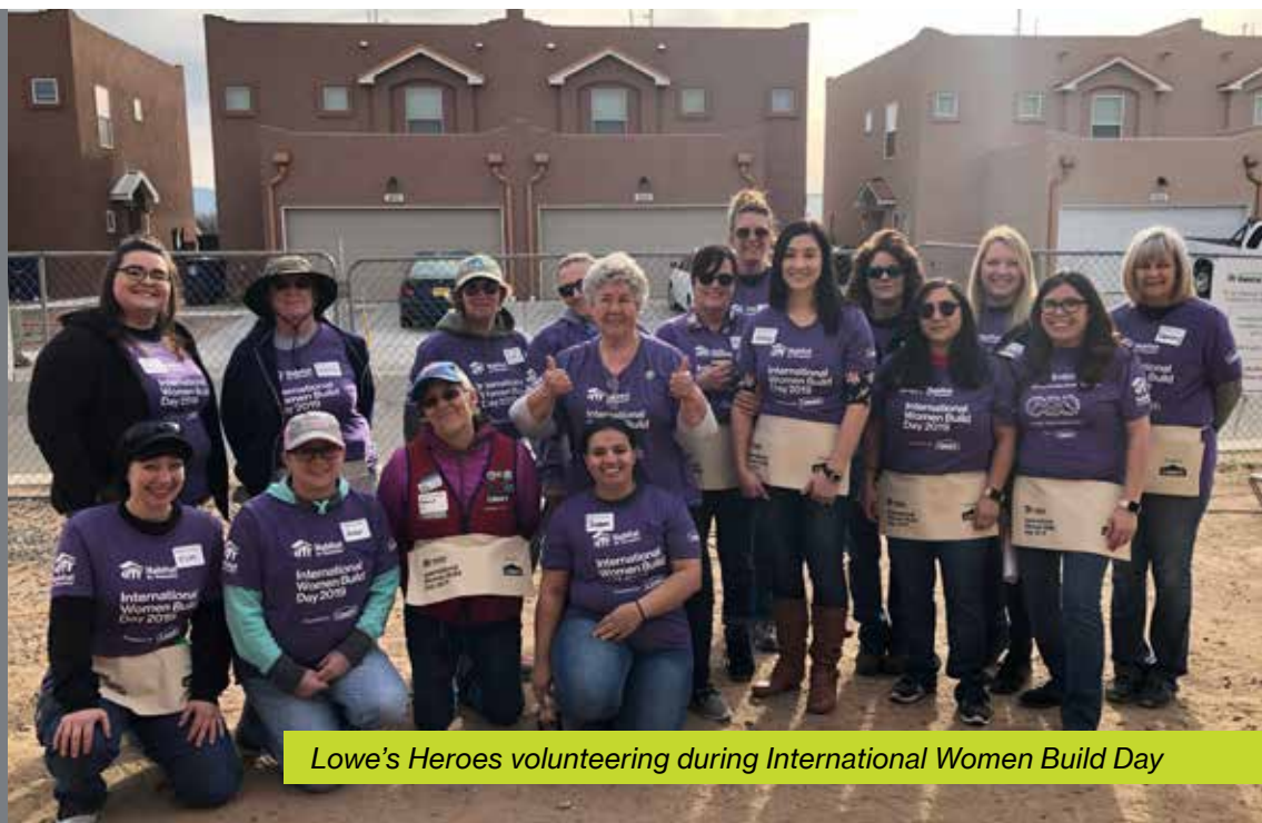
Lowe’s Heroes volunteering during International Women Build Day

In recognition of International Women’s Day, Habitat for Humanity and Lowe’s raised awareness of affordable housing needs facing women and children around the world. Our affiliate was one of 18 affiliates selected to participate in the inaugural International Women Build Day and received a $25,000 grant from Lowe’s.